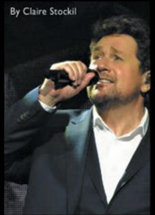
By Claire Stockil