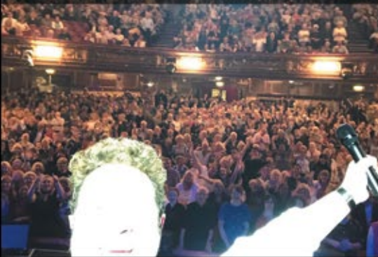
LONDON NIGHT ONE