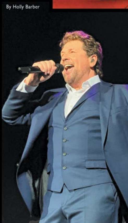
By Holly Barber