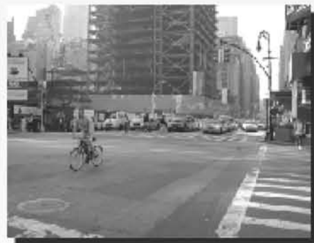
Let's find a Cab.