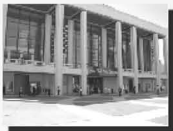
Outside of The Lincoln Centre.