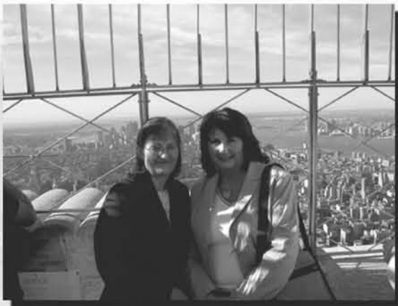
OK how did we get up here and more importantly WHY? Friday morning at the top of the Empire State Building