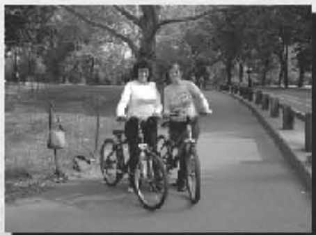
Ok Curly, another fine mess... a bike ride around Central Park