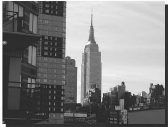
A room with a view, this is a photo from our room of The Empire State Building.