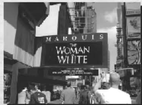
TO BE CONTINUED.....