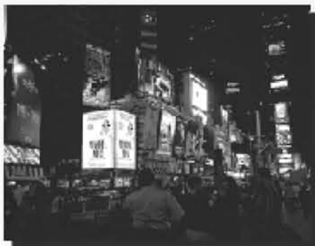
Saturday night in Times Square