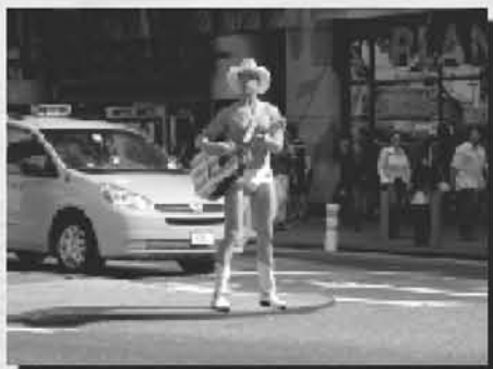
Another fine view in Times Square!!!!!!!!!!!!!!