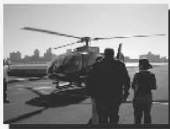
It's too late now, no going back! How do we talk ourselves into these things?