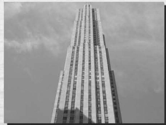
Don't look now but another tall building. The Rockefeller Centre.