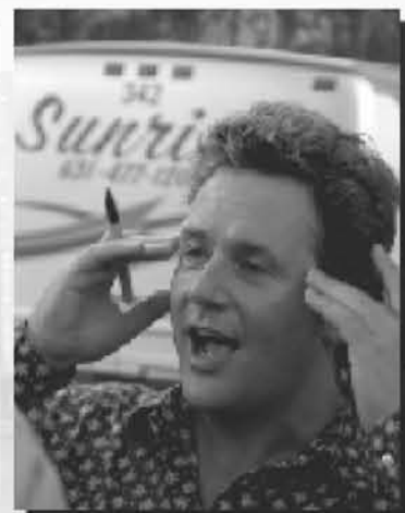
Who am I? Who are all these people?