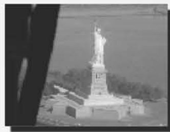
The Statue of Liberty from the Helicopter Trip we took on the Saturday morning.