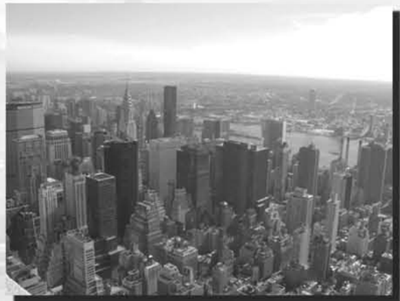
A fabulous view. One of many from the top of the Empire State.