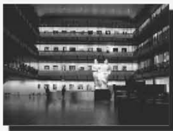
Our destination, The Lincoln Centre the upper hall.