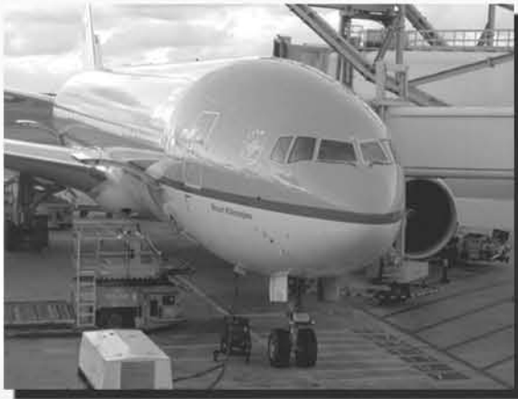
Meet the "Fokker 10" Mount Kilimanjaro our KLM Plane to Amsterdam.