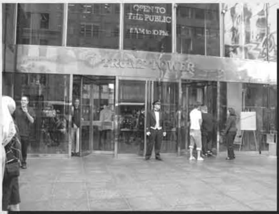
A walk through Manhattan. Who lives here?