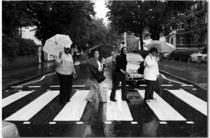
Just had to do the 'Abbey Road' thing...