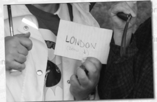
...but it turned out to be a typical rainy day in London (what a surprise) so we had to point out which way London was located in the picture!