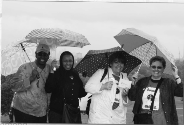
Climbed Primrose Heath to see London below...