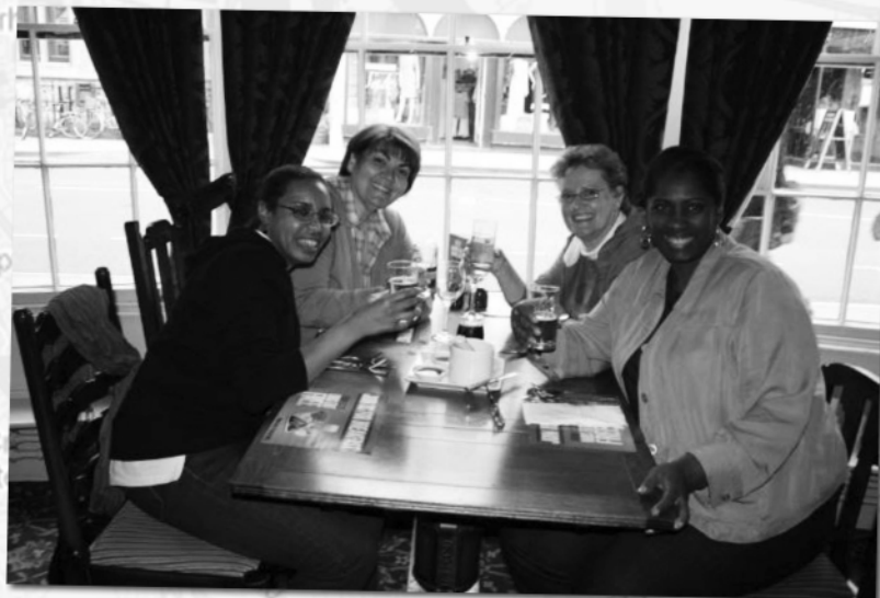
When in Rome.... (or England for that matter)

So after missing him due to our little adventures, we decided to catch him on the last day of the tour at Brighton. We wore our "Power Ball" T-shirts and... we missed him again!!! So we did the next best thing. We took a picture with the tour bus (thanks to Gill and Maureen).