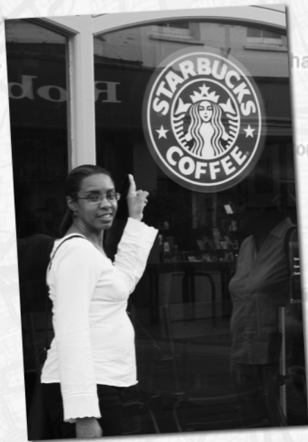
There was one everywhere we stopped - we felt like we were back in New York!