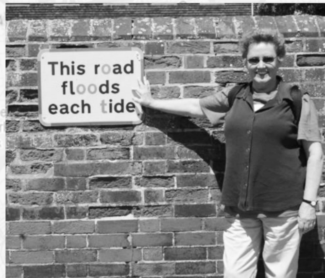
Yes, Bosham is still flooding!