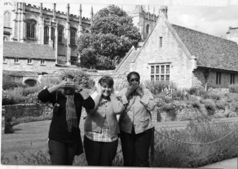
Acted really smart and sophisticated at Oxford University...