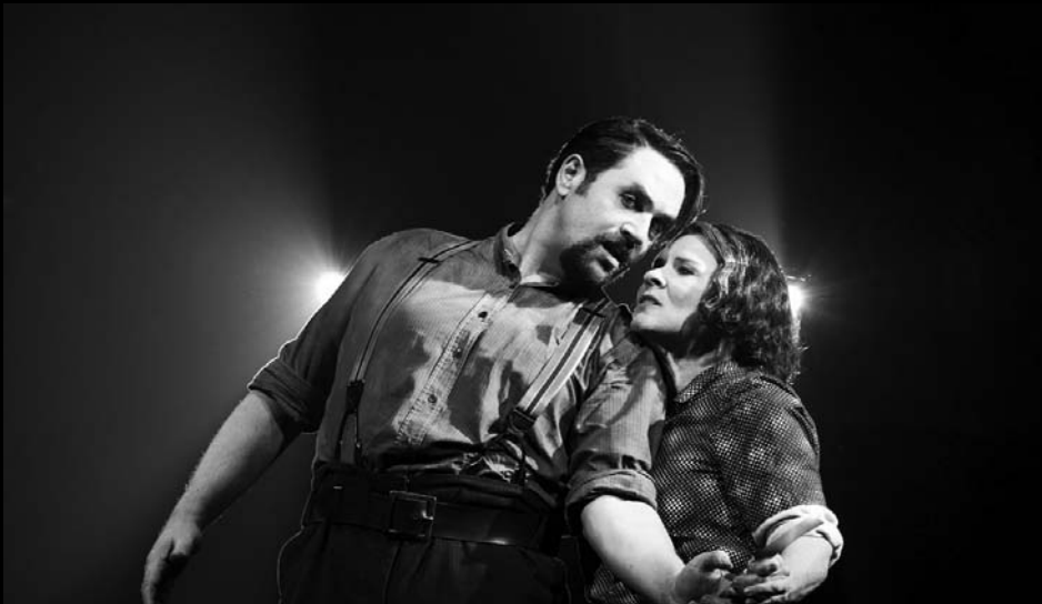
Sweeney Todd and Mrs Lovett

MICHAEL BALL is once again the toast of the West End after making a triumphant debut in the title role of the