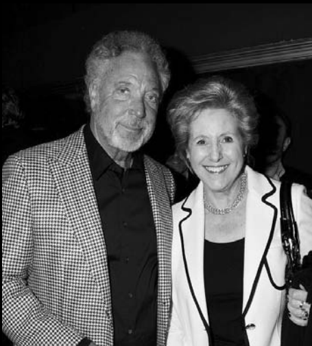
Sir Tom Jones and Dame Norma Major were among the guests