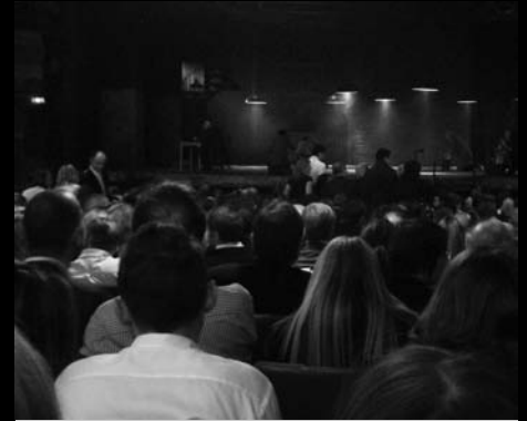
A full house for the show

musical Sweeney Todd, which opened to rave reviews on Tuesday night at the Adelphi Theatre. This production of Stephen Sondheim's famous musical, starring Ball and Imelda Staunton as the demon barber of Fleet Street and his pie-making accomplice Mrs Lovett, has moved to London after a successful run in Chichester and attracted a host of five-star reviews on its opening night.