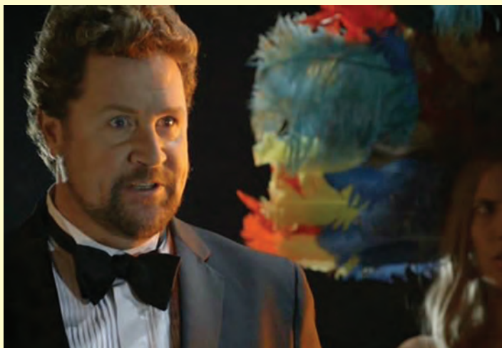
Toast Of London