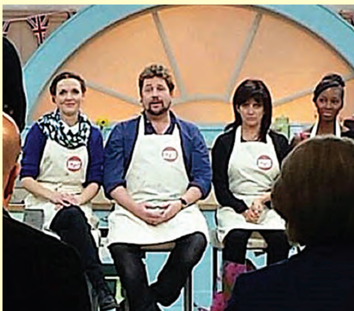
The Great British Bake Off